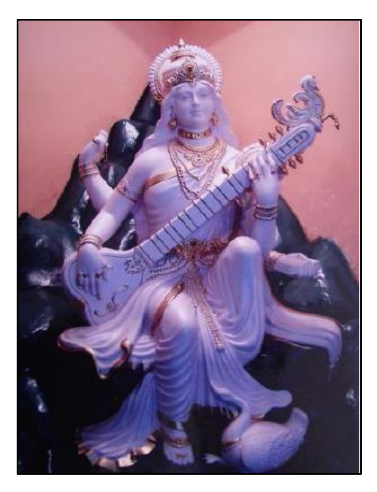
The Goddess of Learning