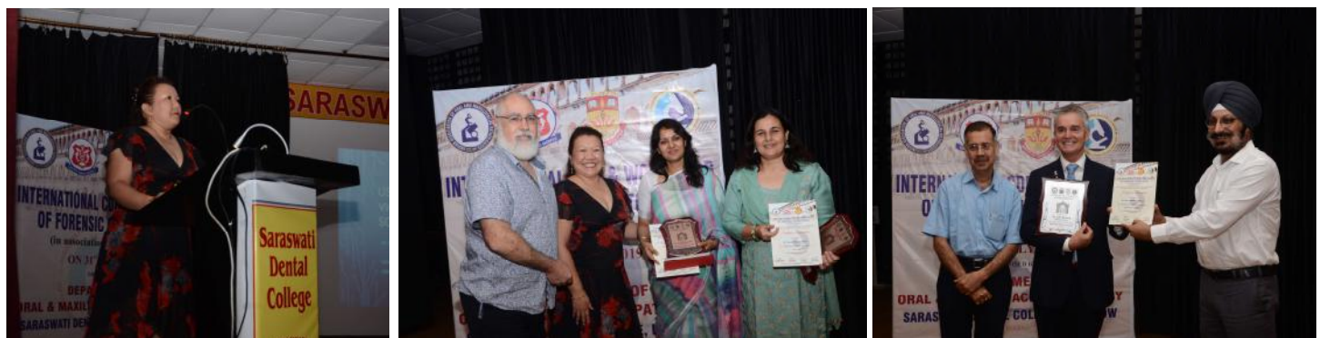
On 31st July Department of Oral Pathology and Association of Indian Association of Oral and Maxillofacial Pathologist {IMOMP} organized CDE WORKSHOP on “DISASTER VICTIM IDENTIFICATION”.