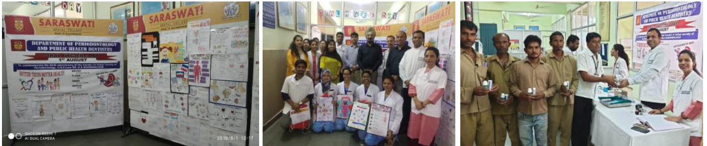
On 1st August Department of Periodontology celebrated “ORAL HYGIENE DAY.”