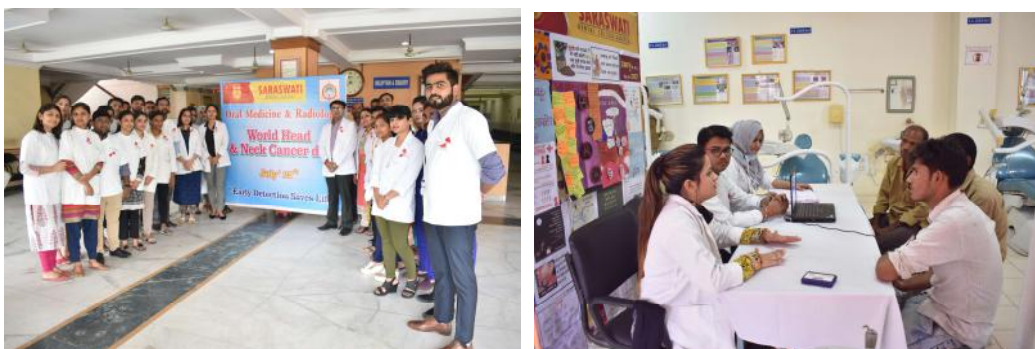
On 27th July OMR with OMFS organized an awareness program on the occasion Of “WORLD HEAD AND NECK CANCER” DAY”.