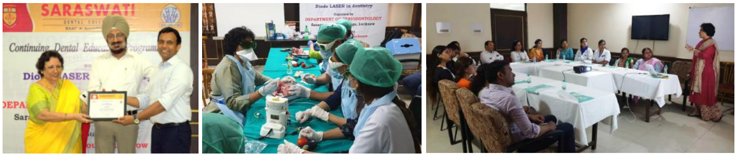
On 3rd and 4th Of July Department of Periodontology organized “CONTINUING DENTAL EDUCATION PROGRAM Entitled DIODE LASER IN DENTISTRY”