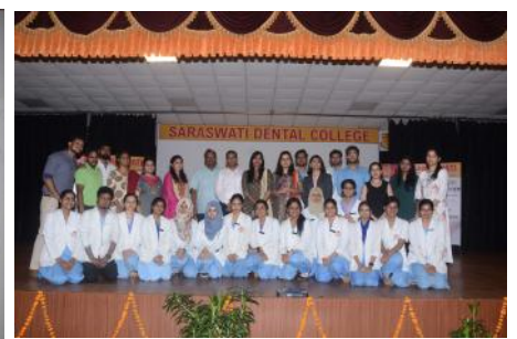
On 4th may Department of Public Health and Dentistry in association with Indian Association of Public Health Dentistry organized CDE program on “DENTAL JURISPRUDENCE & ETHICS.”