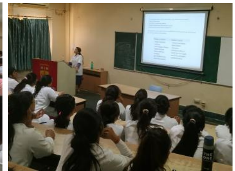
Department of Oral Medicine & Radiology organized a lecture on “TOBACCO INTERVENTION” for the interns on 13 th May 2019, to sensitize our budding doctors towards importance of tobacco control.