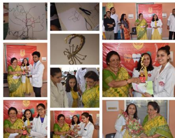
15 th May is celebrated as “WORLD ORTHODONTIC DAY” to motivate and create awareness about braces between the general public. For this mission the Department of Orthodontics in collaboration with OSGOL and IOS which was flagged by Hon. DM of Lucknow.