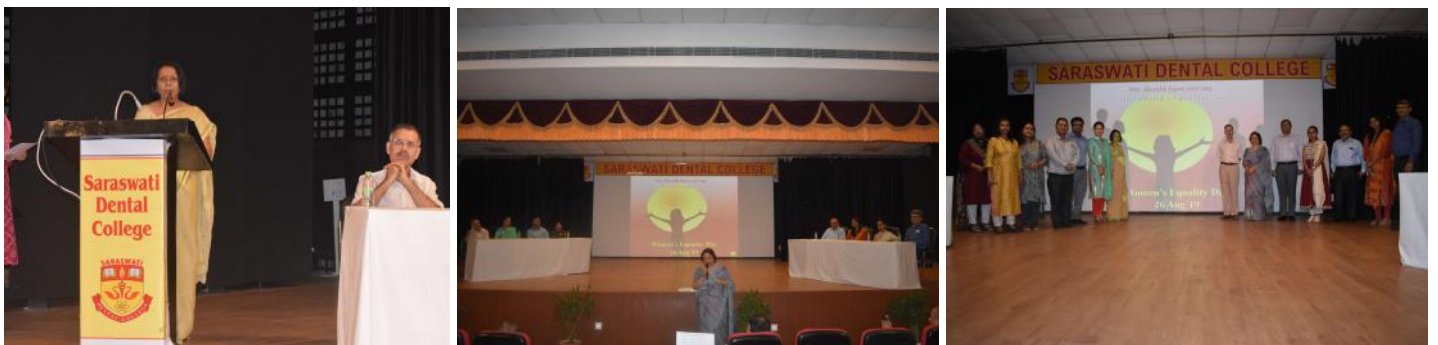
On 26th August 2019 Institutional Women’s Cell (IWC) organized a program on the occasion of “WOMEN’S EQUALITY DAY.”