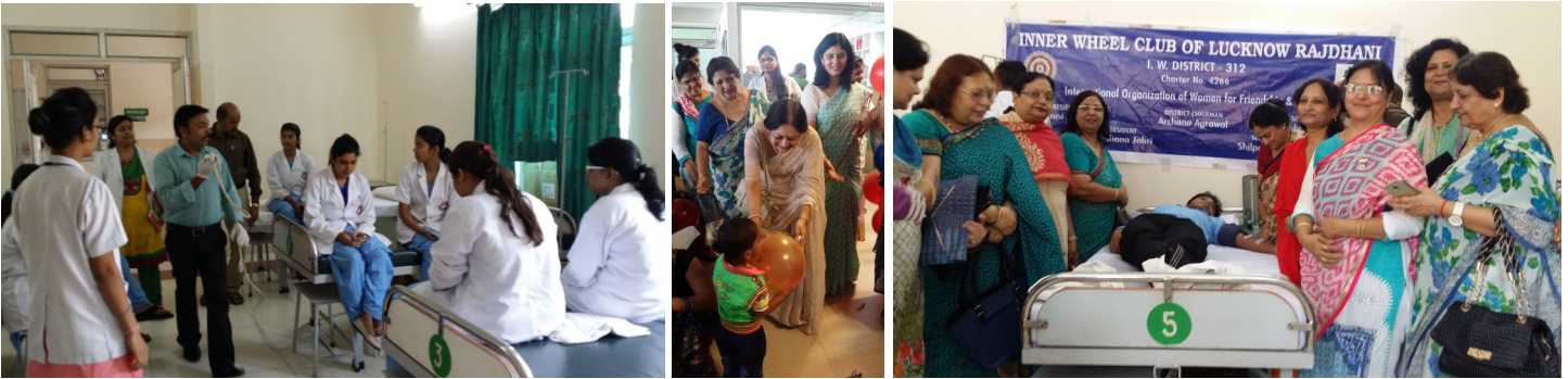
Inner Wheel Club of Lucknow Rajdhani, an International organization of women for friendship and services, organized a blood donation camp and tree plantation drive on 26th Sep. 2016. in Saraswati Hospital and Research Centre and Dental College campus.