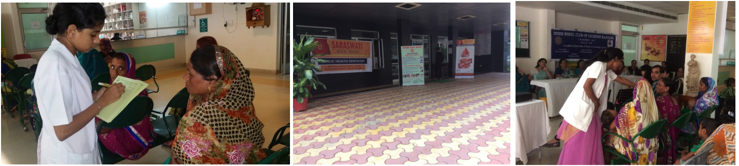
Department of Public Health Dentistry celebrated Breast Feeding Day by conducting a breast feeding awareness campaign at Saraswati Hospital & Research Centre on 3rd Sep. 2016.