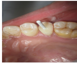
POST CEMENTATION AND CORE BUILDUP