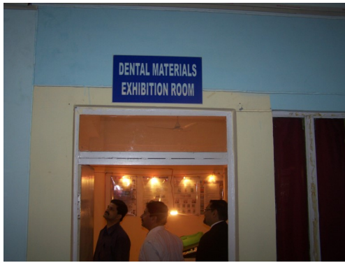
Display of Dental Material exhibition room to the presidents of DCI.