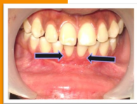
Post-operative (6 months)

A 26-year-old female patient reported to the Department of Periodontology, Saraswati Dental College, Lucknow with the chief complaint of hypersensitivity and unesthetic appearance of lower front teeth since 6 months. The patient presented with recession on teeth 31 and 41 along with insufficient attached gingiva and high frenum attachment. An arc-shaped incision was given and a Split thickness bridge flap was mobilized and repositioned coronally with independent sling sutures. The post operative evaluation after 6 months showed complete 100% root coverage.