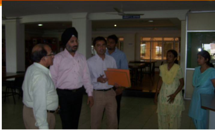
Visit by DCI Inspectors to central library.