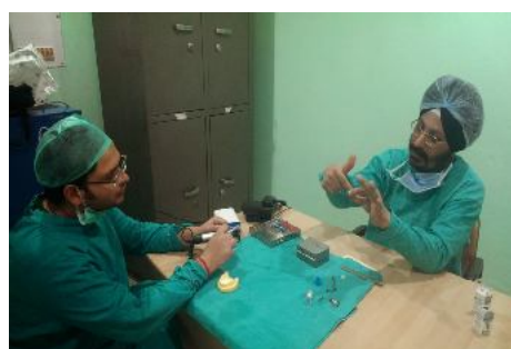
A participant attending Hands-on Workshop on Dental Implants

CDE Program was organized on 29 March 2014. Various Guest Speakers shared their experience on Dental Implants with the Ex and the Present Students