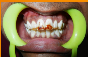
PRE - OPERATIVE