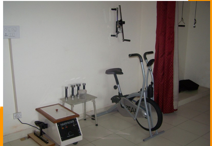
Equipment at physiotherapy unit.

A new unit was introduced in the sarawasti hospital. It was the inauguration of Physiotherapy unit on 23rd September 2010. This was one of the accomplishment for the hospital as it was a necessary unit which lead the hospital to new heights.