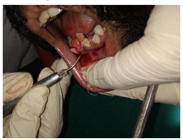
Fig 4: Excision of the lesion by 940 nm wavelength Diode Laser.