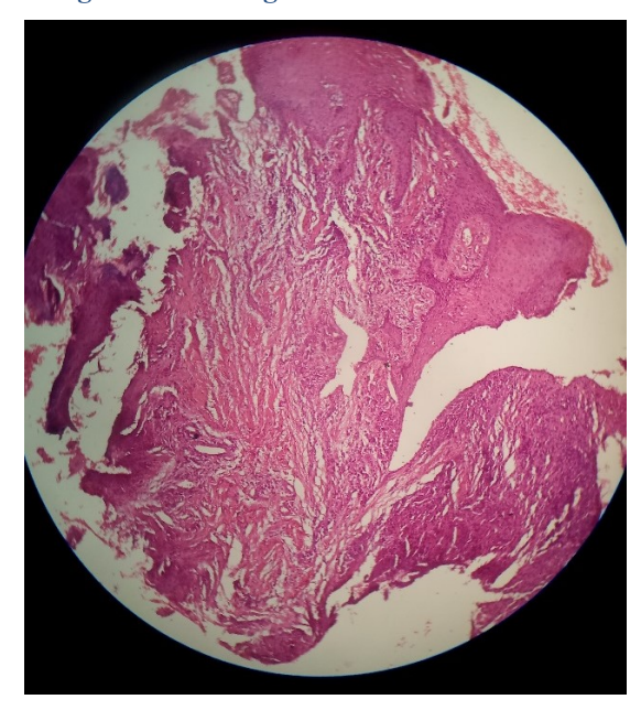
Fig 7: Histological section on 10X zoom

surgically. The excised tissue was sent for histopathological investigations.