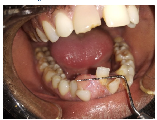
Figure 2: Measurement with UNC 15 probe in 32, 31, 41 and 42 region.

that progressed gradually to the present size (Fig. 1 & 2). There was no contributory medical and family history whereas patient gave history of trauma which is the prime reason of tooth displacement. Radiographic examination in the region reveals the absence of any bony lesion on 32, 31, 41 and 42 region (Fig. 3). On intraoral examination, a well-defined growth was present in relation to 31, 41 and 42 region measuring about 1 cm × 1.2 cm in diameter extending from mesial aspect of 42 to 32 along the incisal edges. On palpation, swelling was nontender, sessile, and soft in consistency.