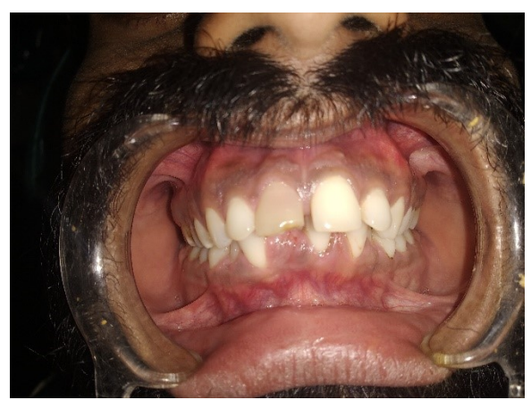
Figure 1: A well-defined growth in relation to 42, 41, 31, 32 region extending from distal region of 42 to mesial region of 32.