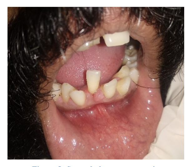
Figure 8: Seventh day post-operative

Histologically, the tissue section revealed hyperkeratinized stratified connective tissue. The epithelium showed slender rete ridges with atrophy in some areas. The connective tissue exhibited reticular arrangement of collagen bundles interrupted with vital bone. The section also showed numerous dilated capillaries. On the basis of clinical, histopathological, and radiographic examination, the diagnosis of POF was given (Fig. 6 & 7). The patient presented for a follow-up examination 7 days postoperatively (Fig. 8). The healing at the surgical site was uneventful.