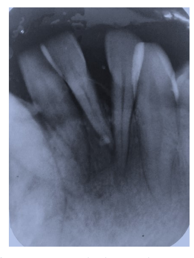
Figure 3: Intraoral periapical radiograph of 32, 31 41 and 42 region.

Based on the history, clinical examination, blood investigations and IOPAR the case was provisionally diagnosed as POF. The differential diagnosis considered was PGCG and pyogenic granuloma. Under topical local anesthesic gel, excisional biopsy was performed using Diode